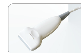
7.5 MHz linear probe