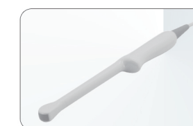
6.5 MHz transvaginal probe