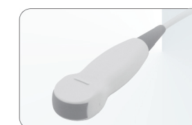
3.5 MHz micro-convex probe