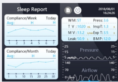
Patient-device synchrony Real-time displaying