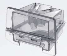
Efficient heating humidifier system